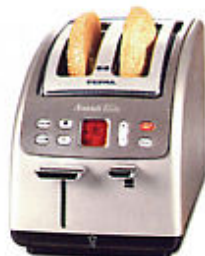
◀ Avanti Elite two-slice toaster, £39.99, Tefal.

Invest in the latest models and make breakfast a treat