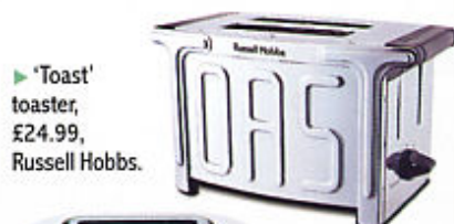
▶ 'Toast' toaster, £24.99, Russell Hobbs.