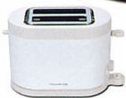
◀ Neo toaster, £24.99, Rowenta.