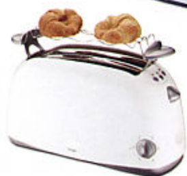
◀ Breville white toaster, £19.99, Argos.