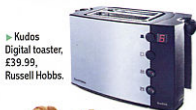
▶ Kudos Digital toaster, £39.99, Russell Hobbs.