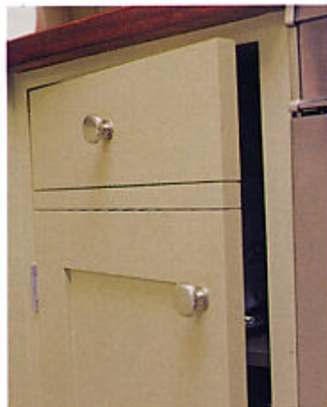
▲ Clever storage optimises space without compromising the overall look

essential, and with four children a dishwasher was a must,' says Karen. 'Plus it had to have large worksurfaces and plenty of storage space.'