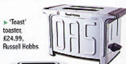
'Toast' toaster, £24.99, Russell Hobbs