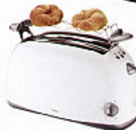
Breville white toaster, £19.99, Argos