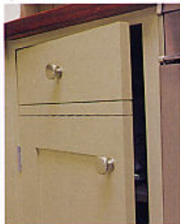
Clever storage optimises space without compromising the overall look

essential, and with four children a dishwasher was a must,' says Karen. 'Plus it had to have large worksurfaces and plenty of storage space.'