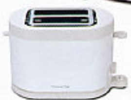
Neo toaster, £24.99, Rowenta