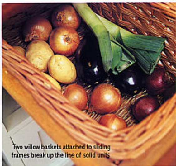
Two willow baskets attached to sliding frames break up the line of solid units