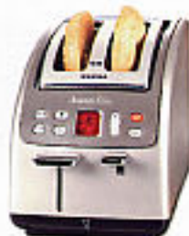
Avanti Elite two-slice toaster, £39.99, Tefal

Invest in the latest models and make breakfast a treat