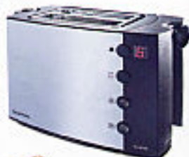
Kudos Digital toaster, £39.99, Russell Hobbs