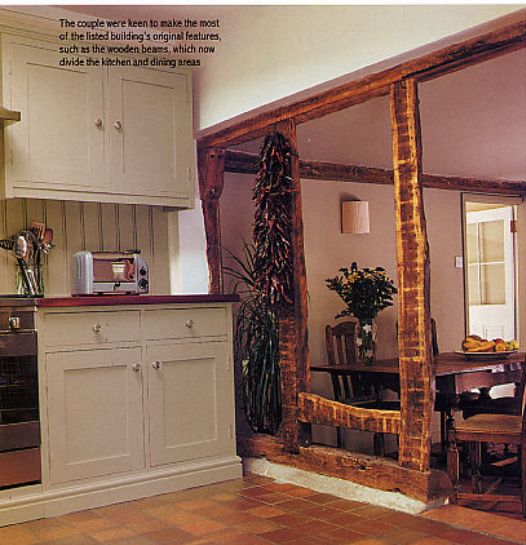
The couple were keen to make the most of the listed building's original features, such as the wooden beams, which now divide the kitchen and dining areas