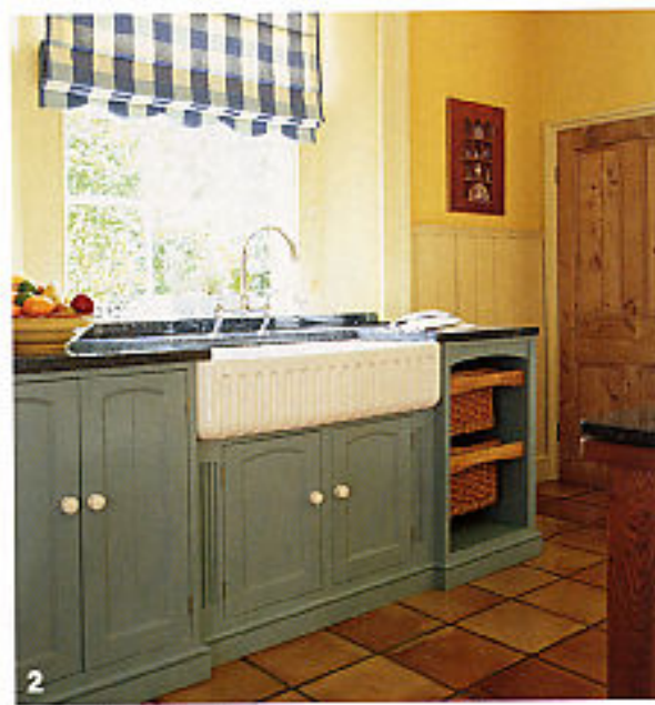
2 The units are painted in Oval Room Blue in eggshell, while the tongue-and-groove panelling is in Cream; both are from Farrow & Ball

a central island specially built,' says Lorraine. 'However, I was really keen that whatever we chose should look antique. We saw the pine server when we were buying our dressers and I really liked it. Its height, long rectangular shape and antique look make it the perfect choice for this kitchen.' The pine top was then overlaid with Blue Pearl granite to create an attractive yet durable work surface.