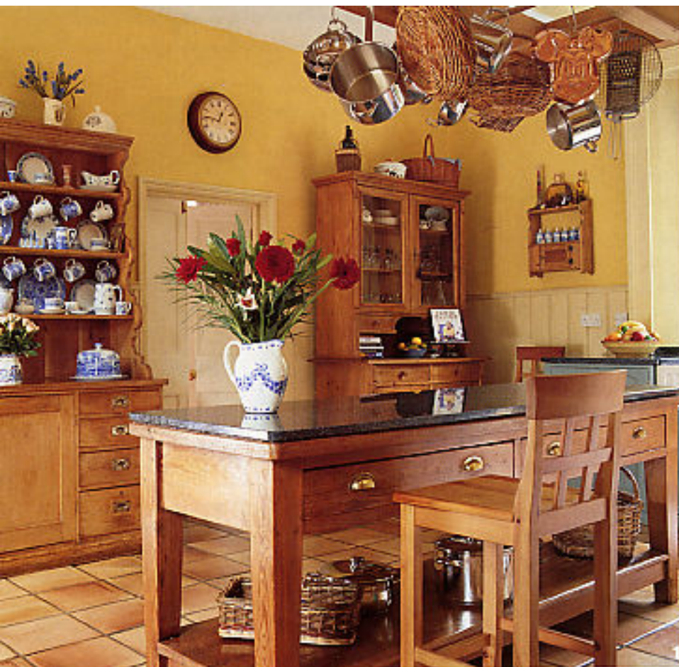
1 The couple bought the two pine dressers and pine server from Earsham Hall Pine. The freestanding units provide ample storage space